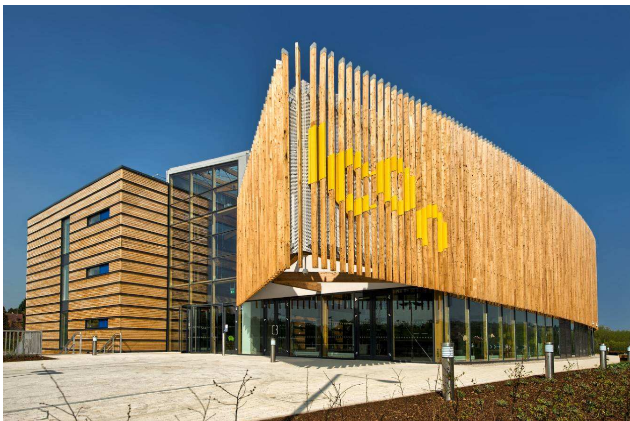
The iCon Innovation Centre in Daventry, United Kingdom, adopting DuPont™ Energain® phase change material as thermal mass to improve energy efficiency; project by Consarc Architects; photo by Andrew Hatfield, all rights reserved.

When a new icon of architecture is dedicated in both design and function to the purpose of “Innovation” it makes perfect sense to specify the most innovative solutions to energy-efficiency. Consarc architects won the competition to design the iCon Innovation Centre in Daventry with an exciting proposal for a building that would embody not only the highest standards of aesthetics and human-friendly design, but also optimum sustainability. DuPont™ Energain®, the pioneering phase change material from a global leader in forward thinking, helped to enable these goals by adding lightweight, high-tech thermal mass.